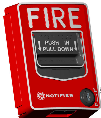
The NBG-12LX Addressable Manual Pull Station