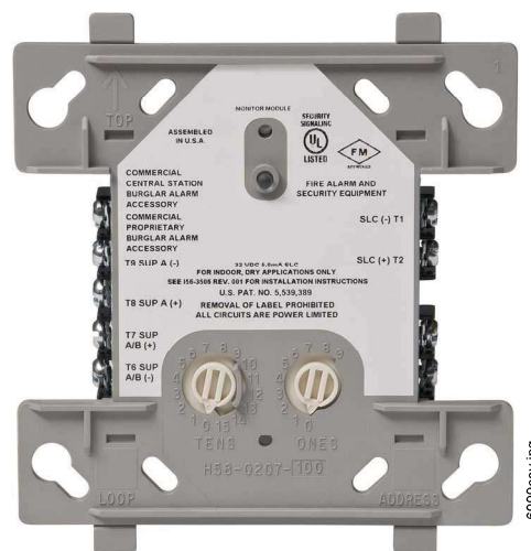
FMM-1(A) (Type H)

Use to monitor a zone of four-wire smoke detectors, manual fire alarm pull stations, waterflow devices, or other normally-open dry-contact alarm activation devices. May also be used to monitor normally-open supervisory devices with special supervisory indication at the control panel. Monitored circuit may be wired as an NFPA Style B (Class B) or Style D (Class